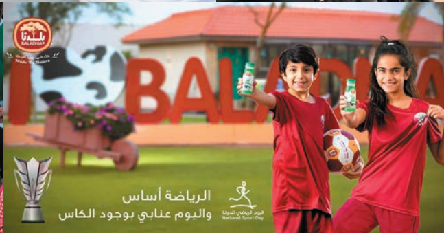
الرياضة أساس واليوم عنابي بوجود الكاس اليوم الرياضي الوطني National Sport Day