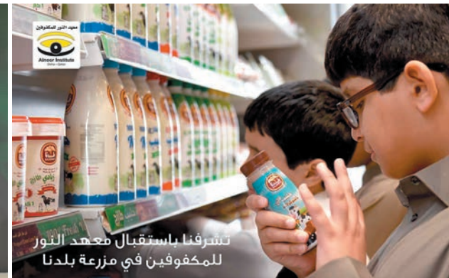
تسرفنا باستقبال معهد النور للمكفوفين في مزرعة بلدنا