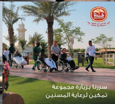
سررنا بزيارة مجموعة تمكين لرعاية المسنين