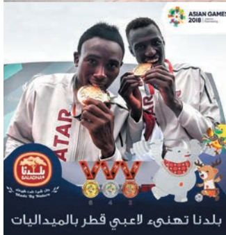
بلدنا تهنيء لاعبي قطر بالميداليات